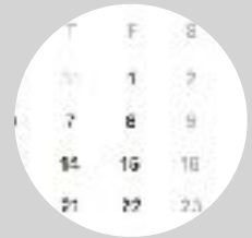
Exhibit Hall Dates & Times

You'll be invoiced for payment, the final step of registration.